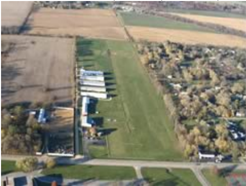
Cottonwood Airport Looking North

WX AWOS-3 at FEP (20 nm W): 119.025 (815-233-4472)